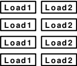
(a) Only load